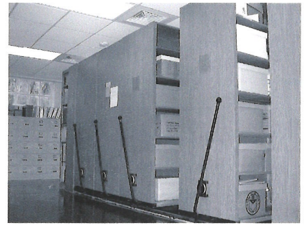
Compact shelving helps AHC provide more materials to the public

The Austin History Center (AHC) recently completed installation of an adjustable compact shelving unit, which was generously donated by a local law firm. This shelving houses archival material that was previously inaccessible to the public. The Friends donated $5,000 to help dismantle the shelves from their original location at the law firm and set them up at AHC.