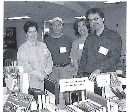
Friends volunteers at the Southwest Book Show.

The Friends of the Austin Public Library is an enthusiastic group of people working to ensure that Austin public libraries can continue to provide quality resources to the citizens of Austin.